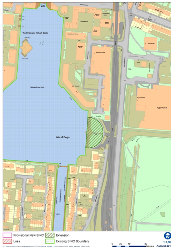
Sinc Review: Millwall and West India Docks

Significant areas of West India Docks have been lost to development in recent years and will be deleted from the site. There is a semi-circle of flower-rich grassland adjacent to the eastern end of Millwall Outer Dock. This contains restharrow, known nowhere else in the borough, and field madder, which is scarce in the borough, as well as a very high density of commoner wild flowers, similar to chalk grassland. Add this grassland to the SINC.